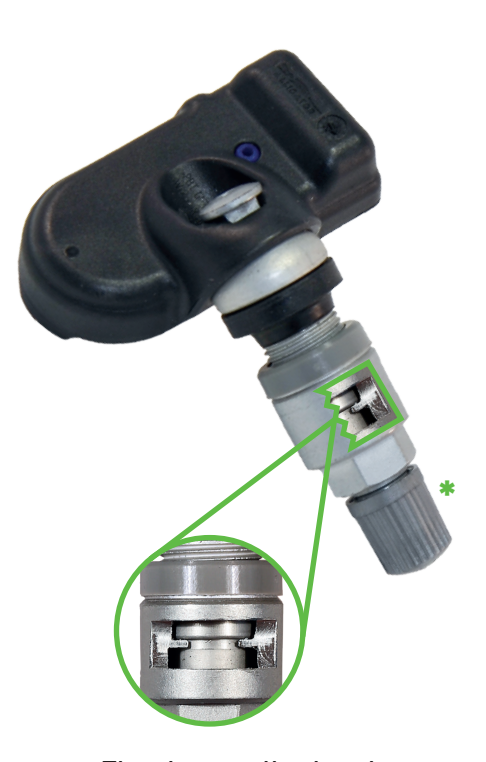
The shear-collar breaks at less than 3.5 Nm

If the components need to be loosened for a second fitting attempt, a new nut and if necessary a new valve stem should be used, as the shear torque increases with the wear on the valve collar.