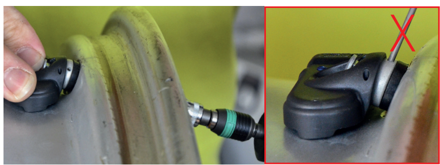
After assembly, check that the housing is seated firmly!

The torque of the bolt is created by the breaking properties of the special shear-collar in hex-nut, which means you must not use the pin during assembly! The valve must turn until the bolt is tightened.